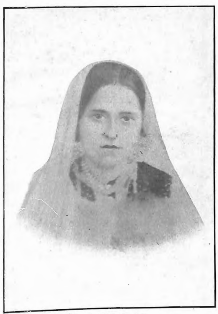
The Author's Mother