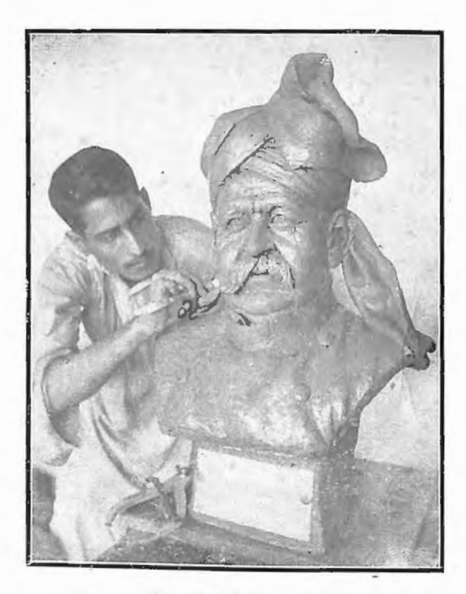
The Rebel Minister