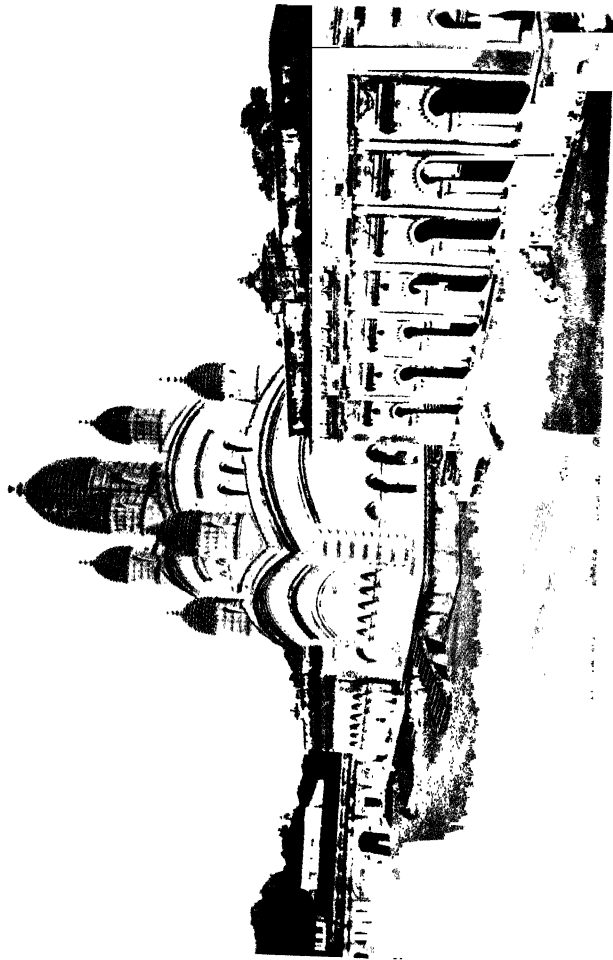
A corner of the courtyard of the Dakshineswar Temple, with the temple of Kali in the middle. See page 32.