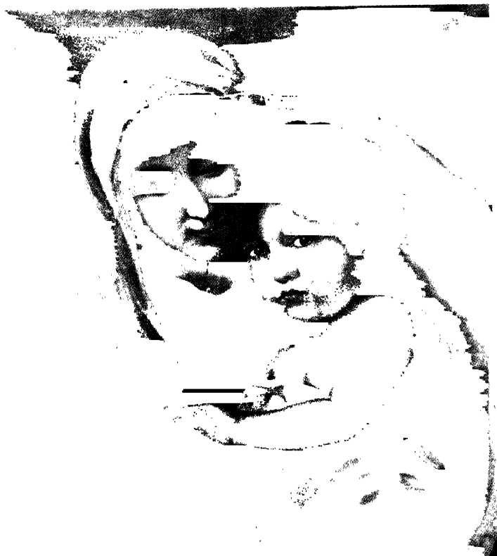
The Madonna and the Child—a facsimile of the picture referred to in page 86.