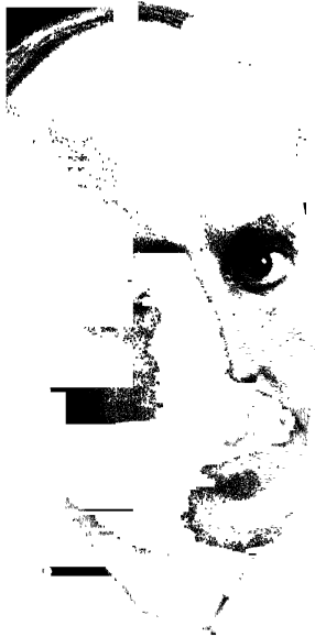
Romain Rolland—a recent portrait