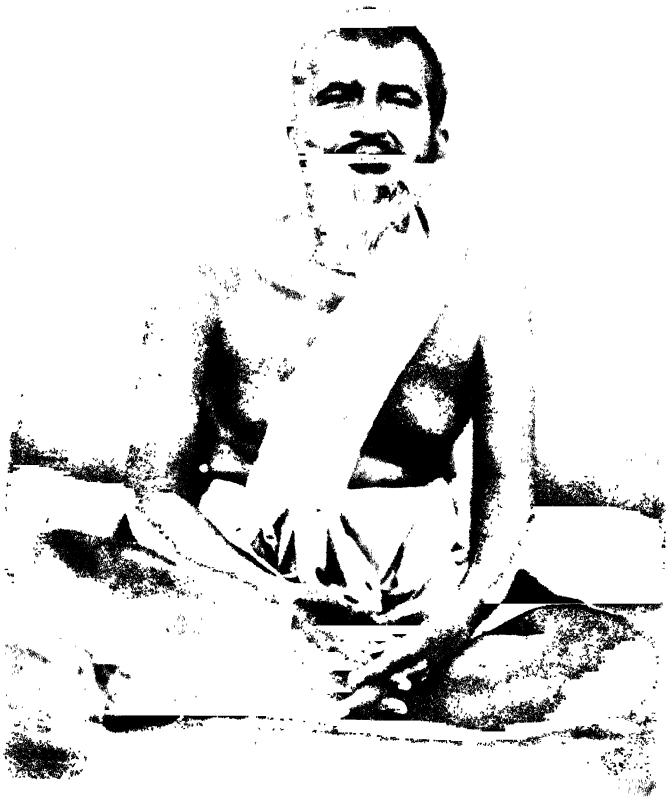
Sri Ramakrishna in a high state of Yoga. See page 339.