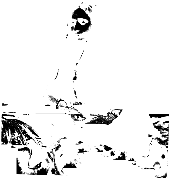
Sarada Devi, wife of Sri Ramakrishna, from a photograph taken about 1897. See page 92.