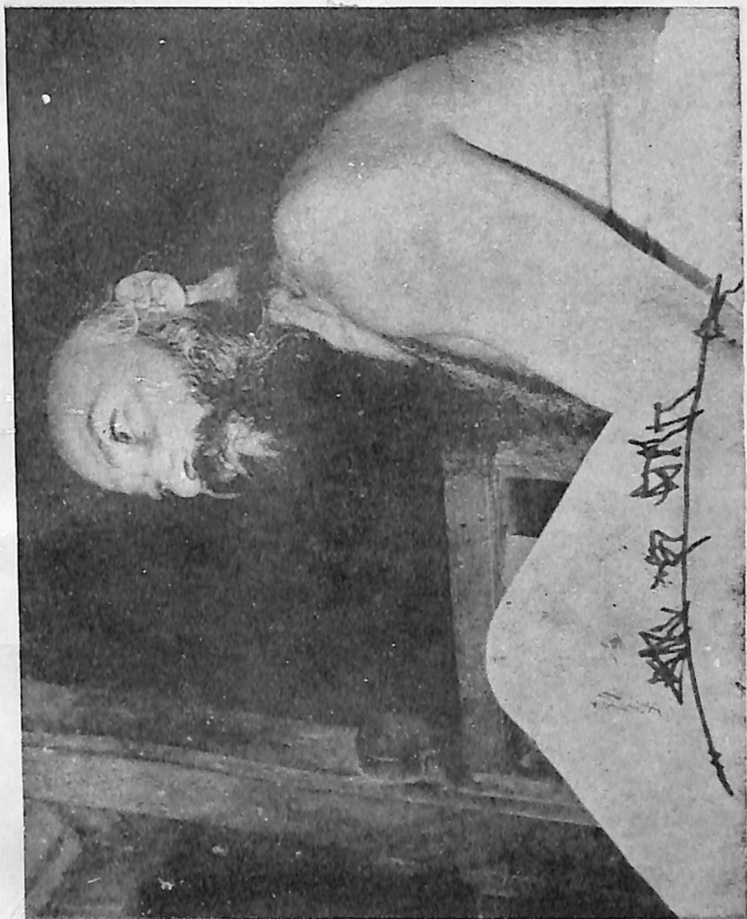
Acharya Shri Rajneesh