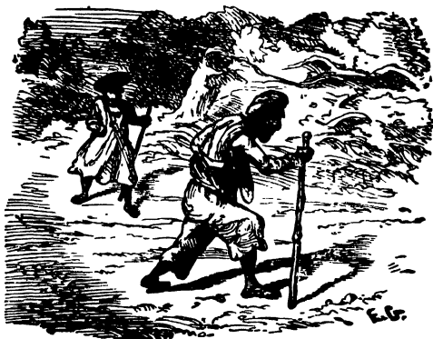
Baman, the second suitor, tied up a bundle and followed

Baman, the second suitor, tied up a bundle of his beloved one's ashes, and followed—somewhat prematurely—the precepts of the great lawgiver Manu. "When the father of a family perceives his muscles becoming flaccid, and his hair grey, and sees the child of his child, let him then take refuge in a forest. Let him take up his conse-