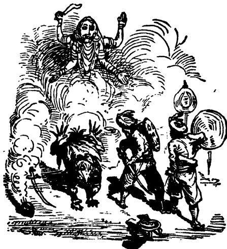
As he bent him down to salute the goddess.

At last the brilliant god, Indra himself, with the thousand eyes, rising from the shade of the Parigat tree, the fragrance of whose flowers fills the heavens, appeared in his car drawn by yellow steeds and cleaving the thick vapours which surround the earth—whilst his attendants sounded the heavenly drums and rained a shower of