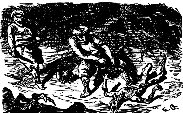
Presently the Demon was trussed up as usual.

Then it struck him as being passing strange that she had begun to love him when the last sand of his life was well nigh run out; that wondrous are the ways of the revolving heavens which bestow wealth upon the niggard that cannot use it, wisdom upon the bad man who will misuse it, a beautiful wife upon the fool who cannot protect her, and fertilizing showers upon the stony hills. And thinking over these things, the gallant and beautiful thief laughed aloud.