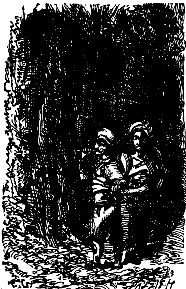
After a few minutes the signal was answered.

After a sharp walk the pair reached a high perpendicular sheet of rock, rising abruptly from a clear space in the jungle, and profusely printed over with vermillion hands. The thief, having walked up to it, and made his obeisance, stooped to the ground, and removed a bunch