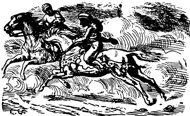
Mounting their horses, followed the party.

In the meantime, the ascetic and his pupil hurrying to the cemetery resumed their proper dresses; they then went to the old nurse's house, rewarded her hospitality till she wept bitterly, girt on their weapons, and mounting their horses, followed the party which issued from the gate of King Dantawat's palace. And it may easily be believed that they found little difficulty in persuading the poor girl to exchange her chance in the wild jungle for the prospect of becoming Vajramukut's wife—lawfully wedded—at Benares. She did not even ask if she was to have a