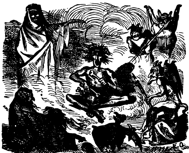
He was playing upon a human skull with two shank bones.

For a moment he thought of the giant's words, "And remember that it is lawful and right to strike off his head