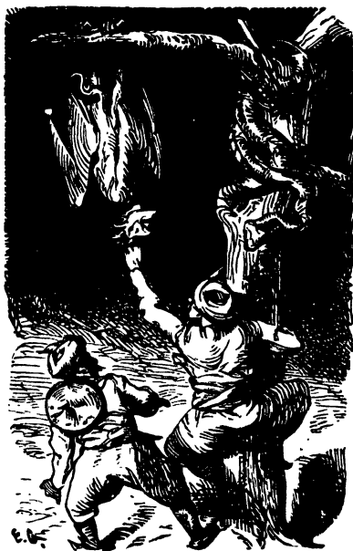
He once more seized the Baital's hair.

"Decidedly this is the young oilman!" exclaimed the Raja, after he had stood for a minute or two with mouth open, gazing upwards and wondering what he should do next. Presently he directed Dharma Dhvaj not to lose an instant in laying hands upon the thing when it next