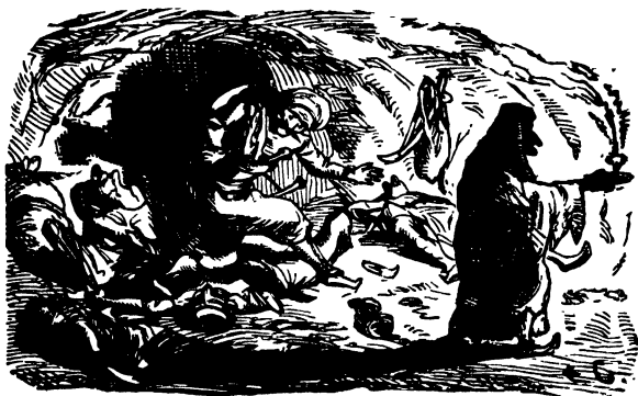
Treading with the foot of a tiger cat.

Then having mentally prepared his measures, the Raja warned a company of archers to hold themselves in readiness for secret service, and as each one of his own people returned from the robbers' cave he had him privily arrested and put to death—because the deceased, it is said, do not, like Baitals, tell tales. About nightfall, when he thought that the thieves, having finished their work of