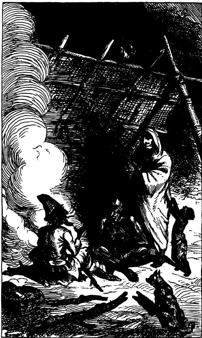
The householder's wife came to serve up the food, rice and split peas ( to face p. 154 ).