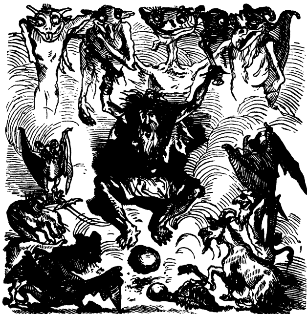
There he found the Jogi.

farewell to the warrior king and to his son. He complimented the former for the last time, in his own way, upon the royal humility and the prodigious self-mortification which he had displayed—qualities, he remarked, which never failed to ensure the proprietor's success in all the worlds.