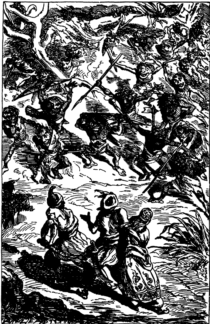
As they emerged upon the plain, they were attacked by the Kiratas (to face p. 311).