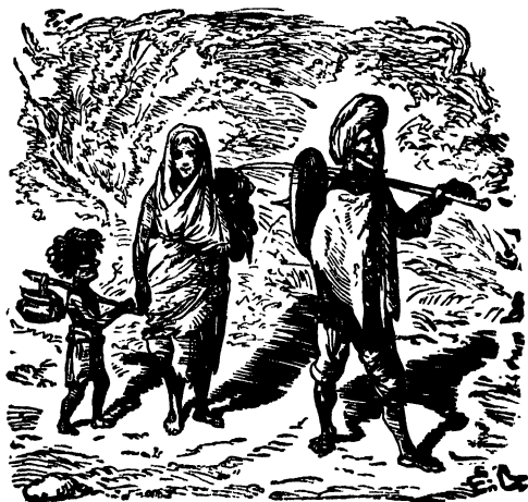
In the meantime a traveller, a Rajput, by name Birbal.

In the meantime a traveller, a Rajput, Birbal by name, hoping to obtain employment, came from the