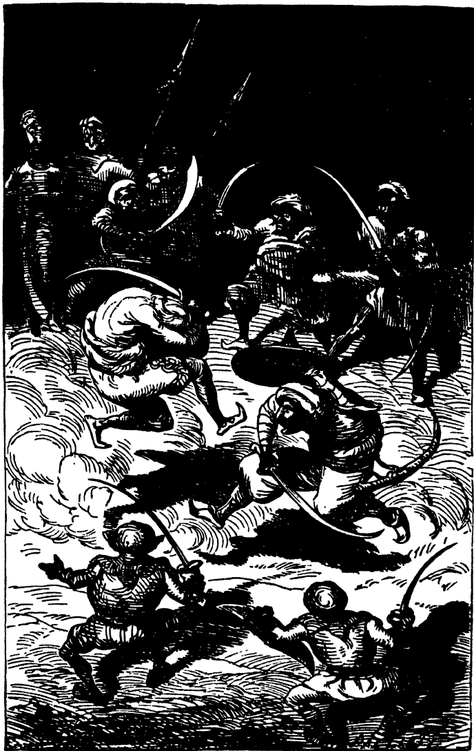
The King was cunning at fence, and so was the thief ( to face p. 136 ).