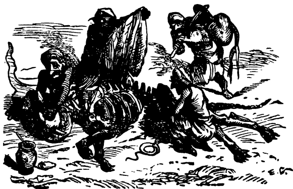
They prepared for their task.

The third drew from his pouch the brain and eyes of