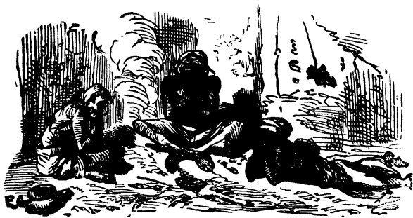
They tried to live without a monthly allowance, and notably they failed.

A month afterwards came the libertine's turn to be disappointed. He could no longer afford fine new clothes; even a well-washed coat was beyond his means. He had