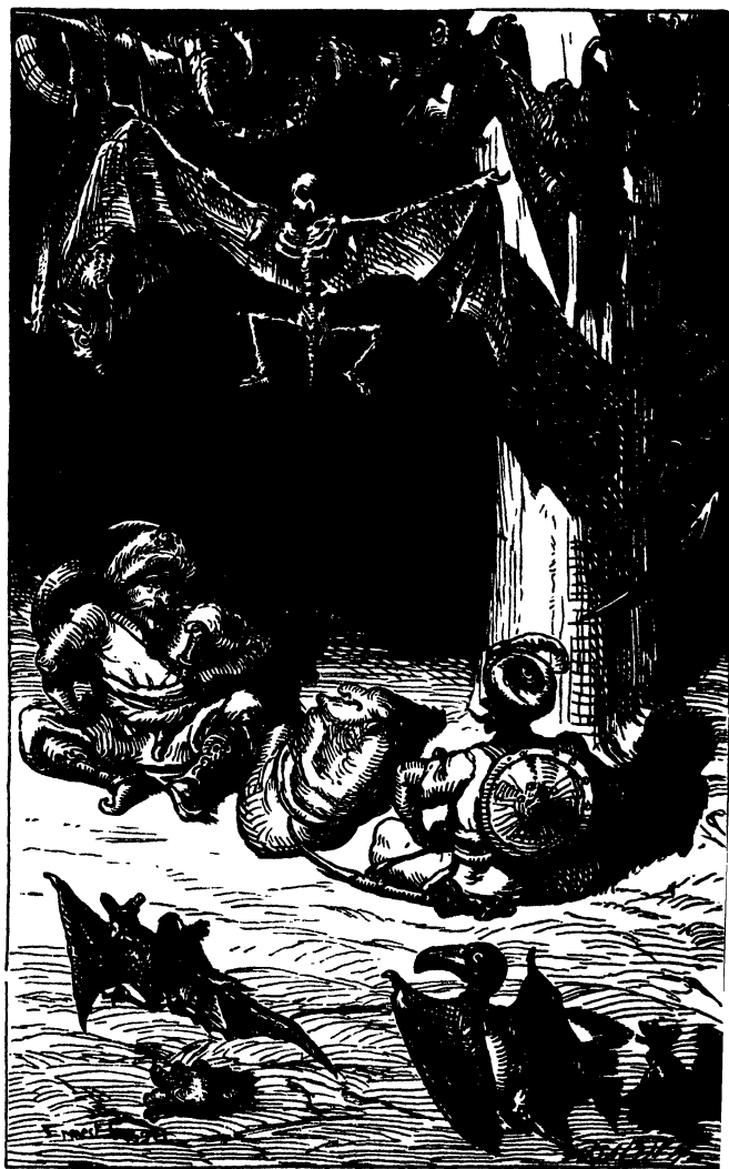
Vikram placed his bundle upon the ground, and seated himself cross-legged before it ( to face p. 158 ).