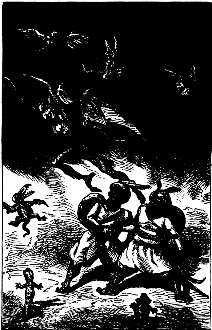
The Baital disappeared through the darkness ( p. 125 ). ( Frontispiece. )