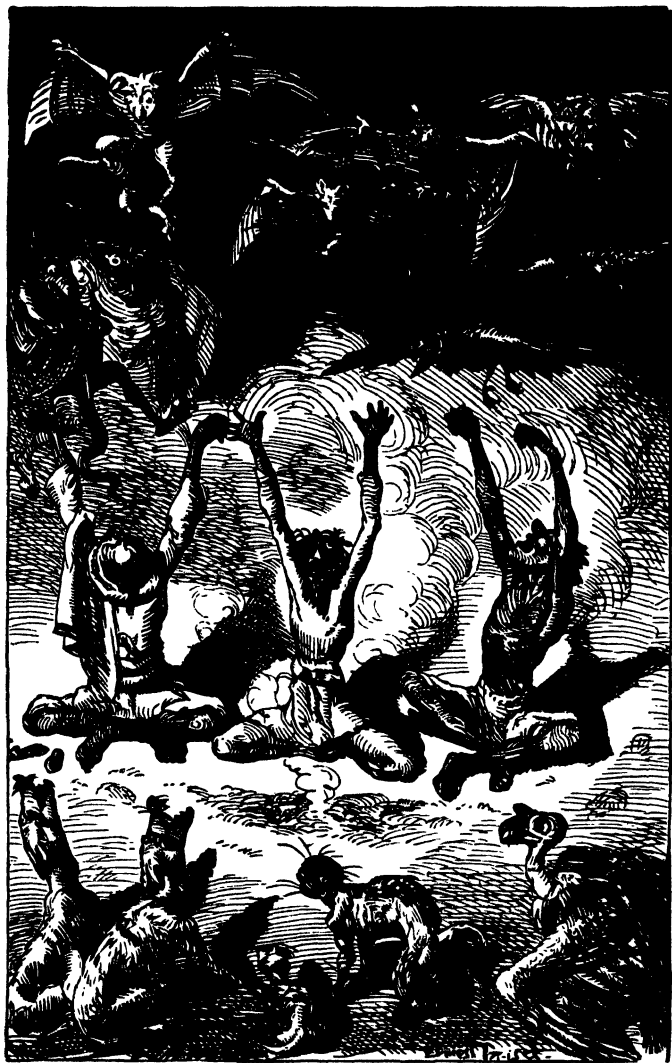
Madhusadan proceeded to make his incantations, despite terrible sights in the air ( to face p. 156 ).