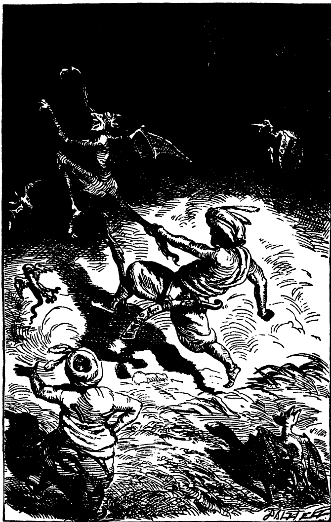
The King, puffing with fury, followed him at the top of his speed, and caught him by his tail (to face p. 106).