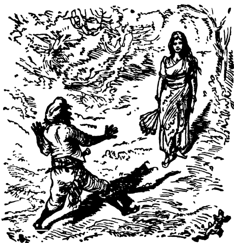
But their eyes had met.

“Nonsense!” exclaimed the warrior king, testily, “I can never believe in that freak of Kama Deva.” He