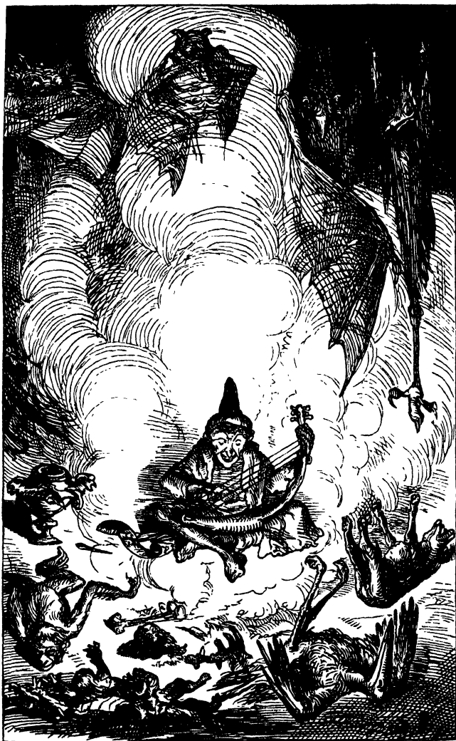
An edifying spectacle, indeed, for the world to see; a cross-old man sitting amongst his gallipots and crucibles ( to face page 173 ).