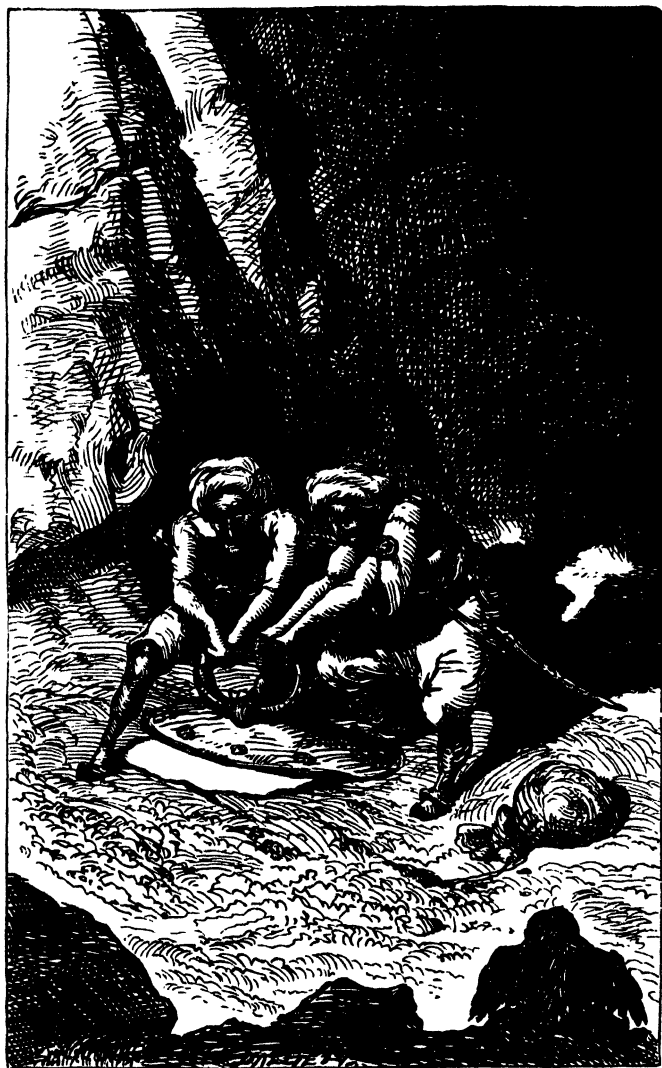
The two then raised, by their united efforts, a heavy trap-door ( to face p. 132 ).