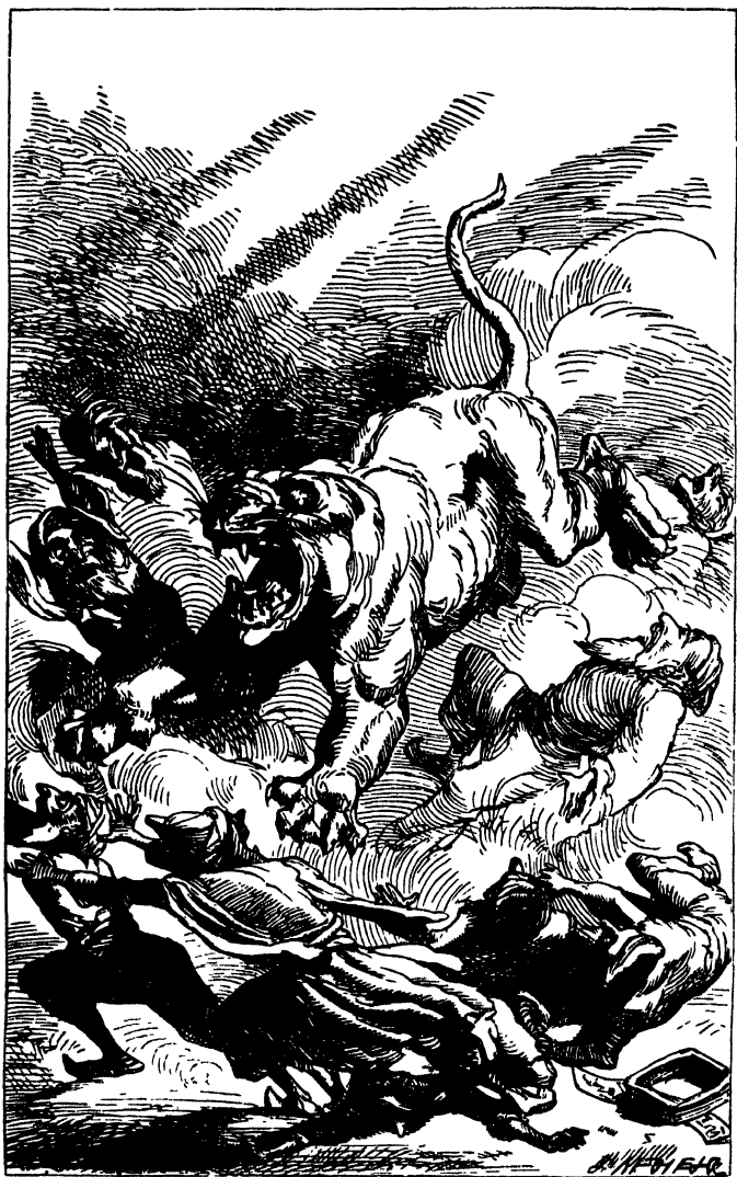
With a roar like thunder (to face p. 179).