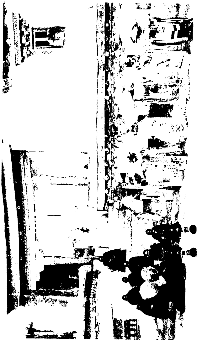
THE DEVIL DANCE OF THE PRIESTS.