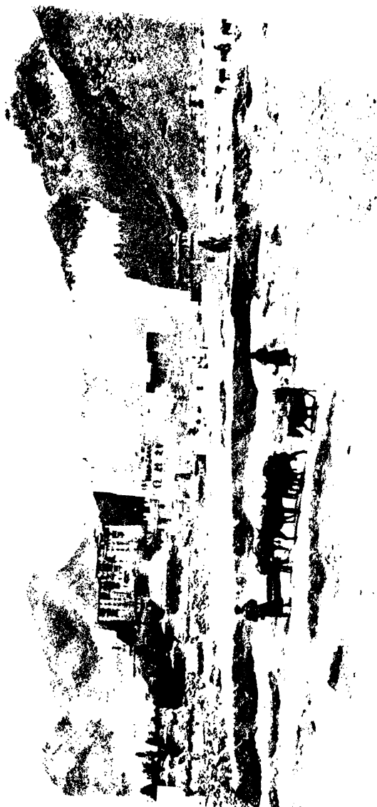
“ One gazes on sandy plain, the town on the hillside, the gardens below to the left ; on the cliffs rises the