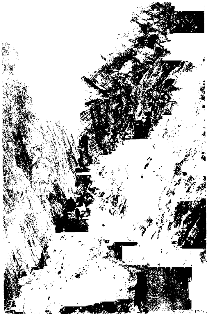
THE ZOGI LÁ PASS, KASHMIR.