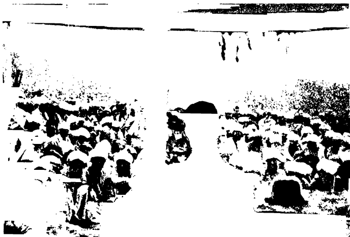
SIR JOHN MAFFEY AT SHINAWARI, ADDRESSING THE MOST IMPORTANT AFRIDI JIRGA EVER HELD.