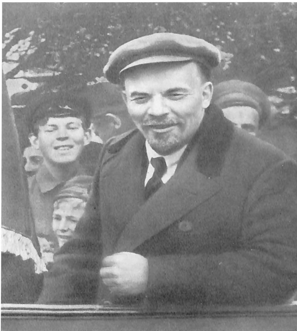
V. I. Lenin. A still. 1919