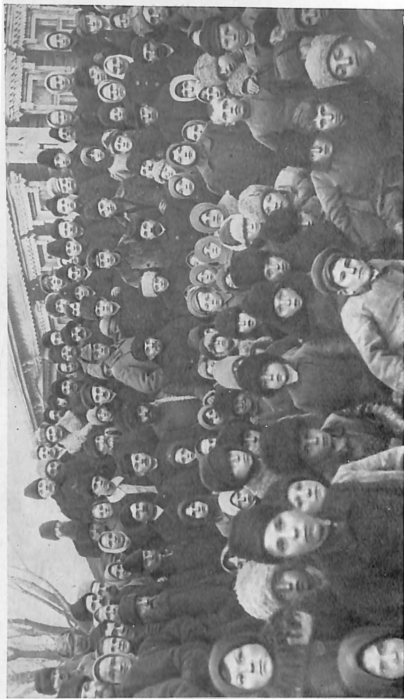
V. I. Lenin and N. K. Krupskaya among peasants of Kashino village, Moscow Gubernia. 1920