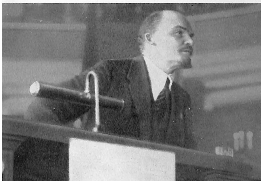
V. I. Lenin at the Second Congress of the Comintern. 1920