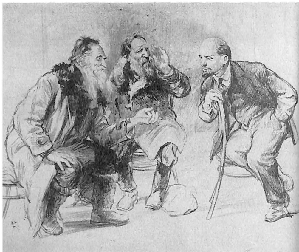
A heart-to-heart talk (drawing by N. Zhukov)