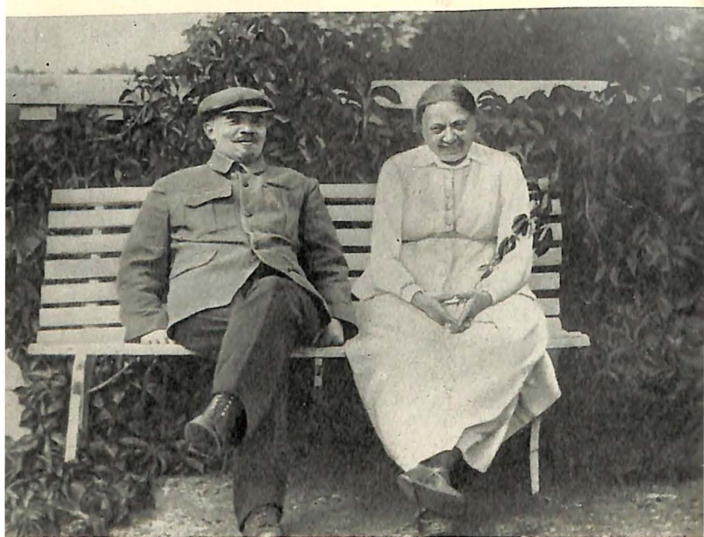
V. I. Lenin and N. K. Krupskaya in the garden in Gorki. August-September, 1922