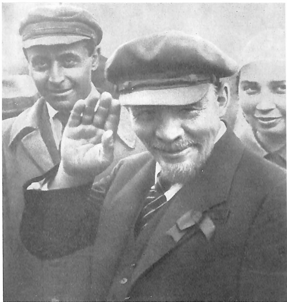
V. I. Lenin. A still. 1920