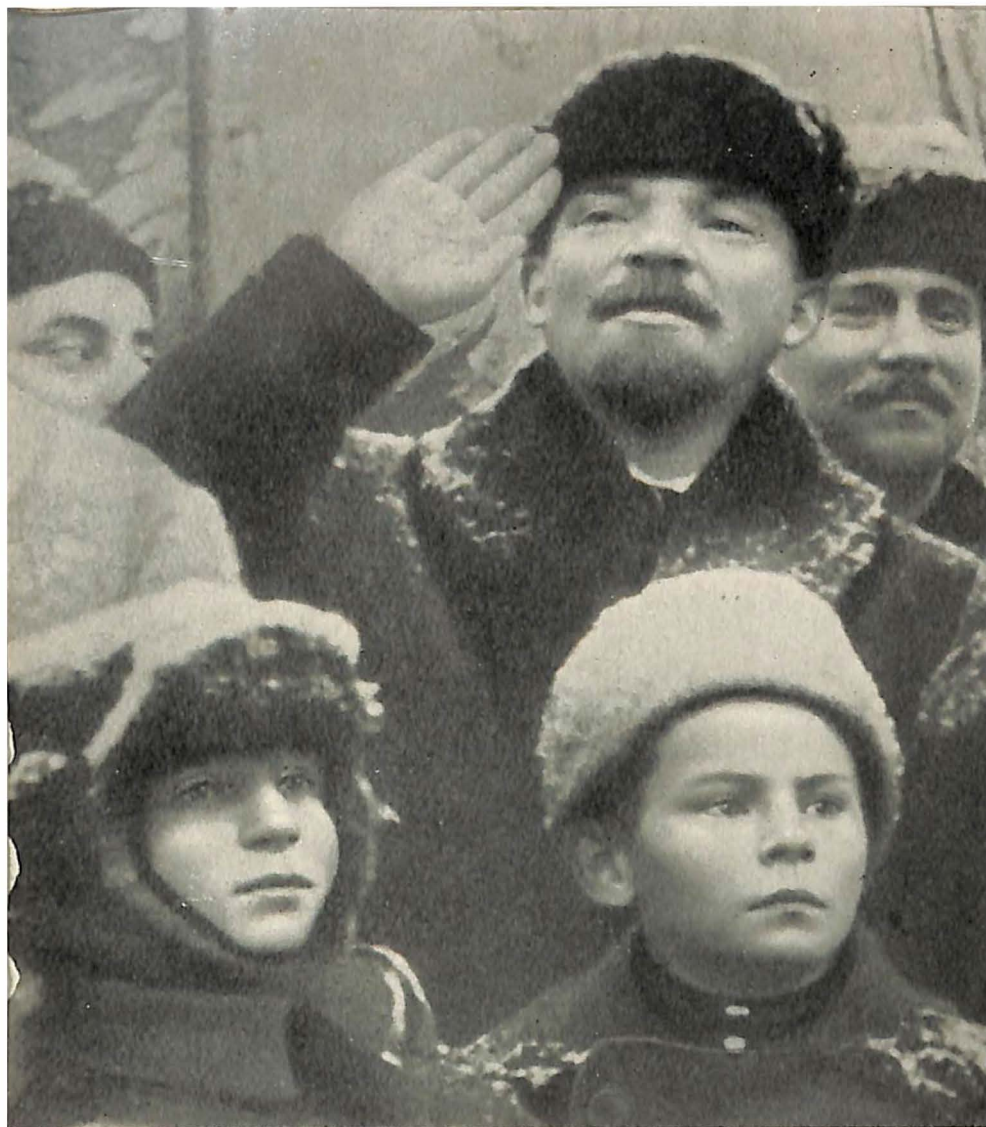
V. I. Lenin on the Red Square. November 7, 1919