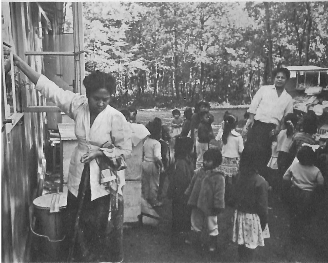
Over 20,000 Ambonese – former members of the Royal Netherlands East Indies Army, and their families – live in camps in the Netherlands. Now that their temporary stay in Europe is likely to be protracted they are gradually being accommodated in permanent dwellings. The picture shows Wyldemarck Camp in Gaasterland (province of Friesland).