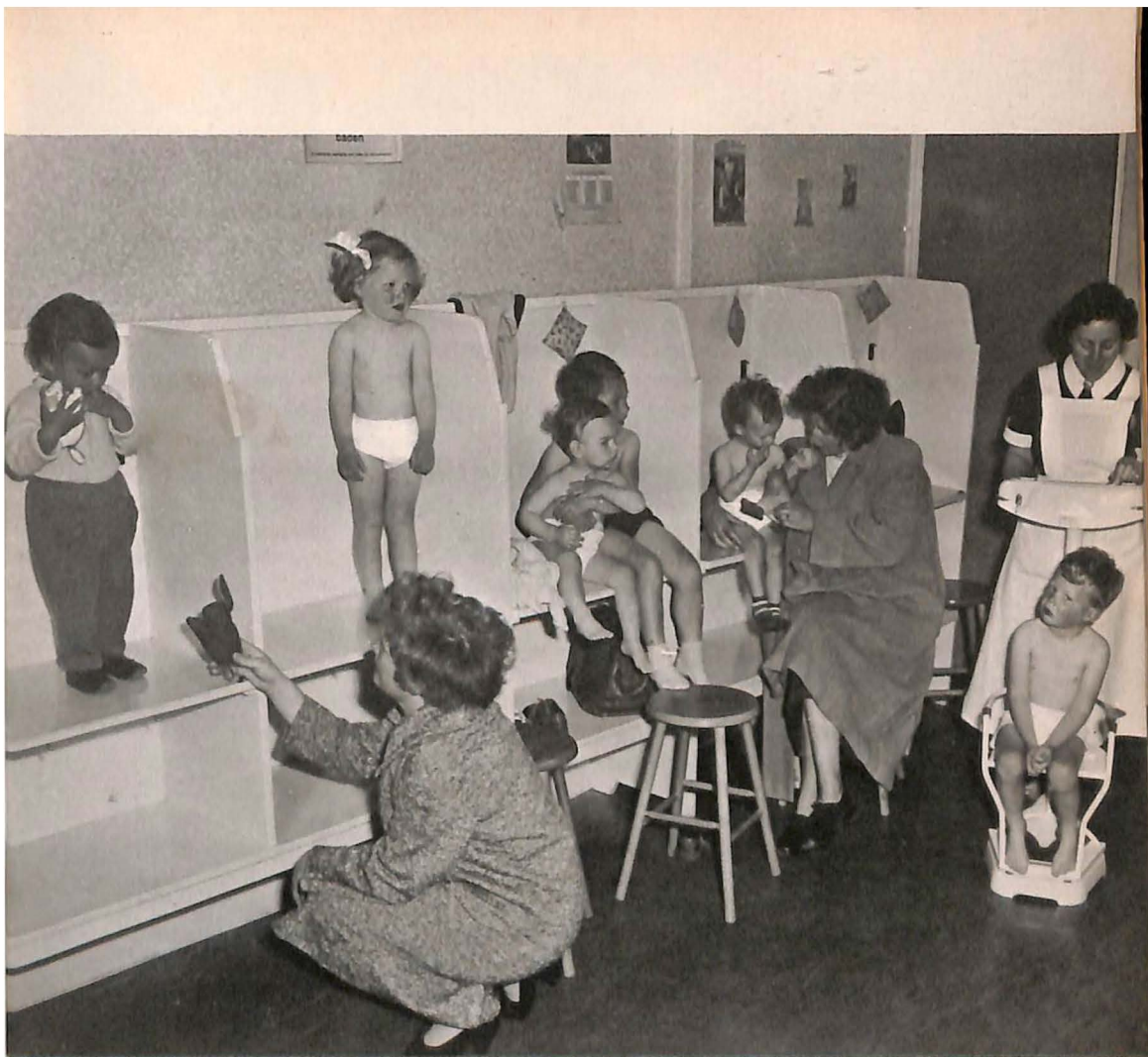
Dressing cubicles in an infants' welfare centre.