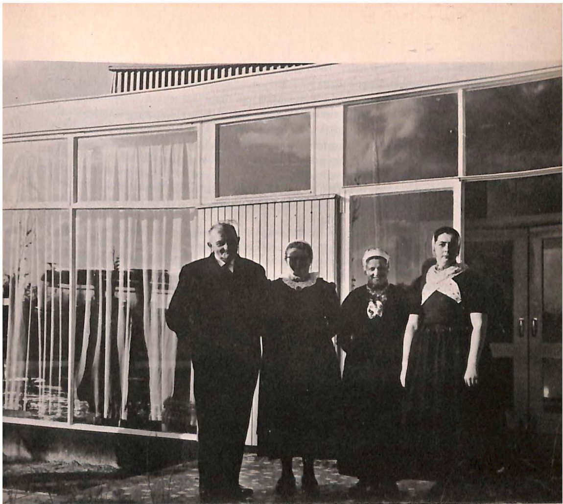
Traditional costumes are still worn on special occasions even where they are no longer in daily use, as is shown in this picture of the opening of the new village centre in Oosterwolde (province of Gelderland). About 190 village and community centres were built with Government subsidy after the Second World War. This has put new life into local clubs and associations.