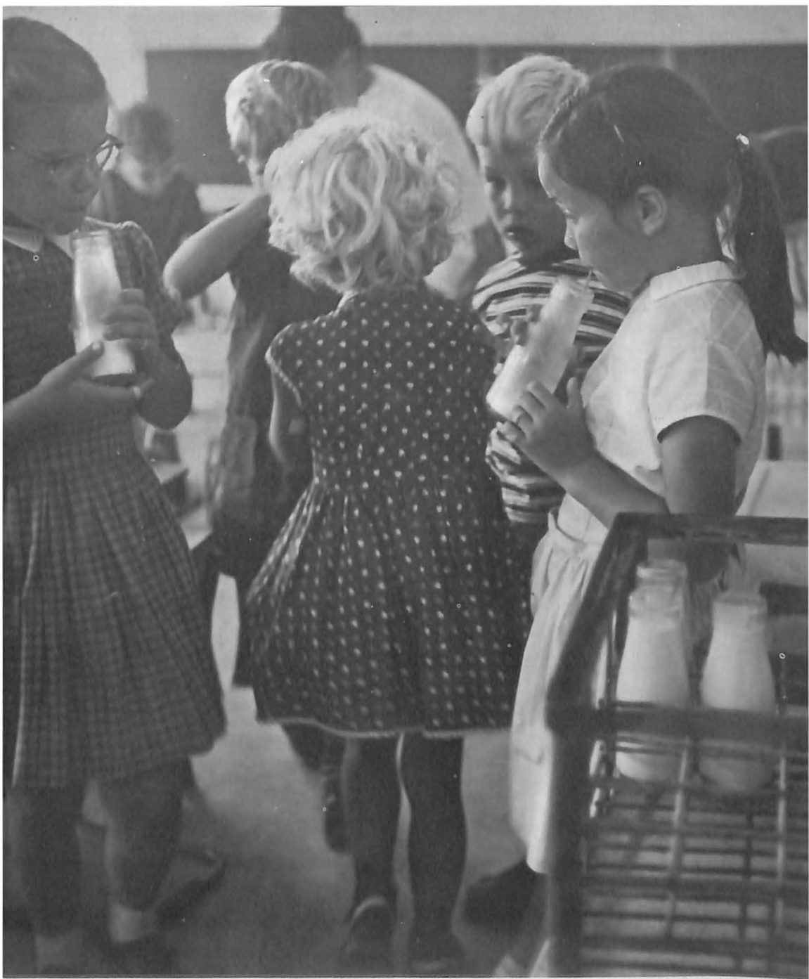
Every morning: Milk for every child in primary schools.